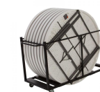
Table cart Réf 80193