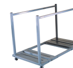
Table cart Réf 6520