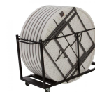
Table cart Réf 80193