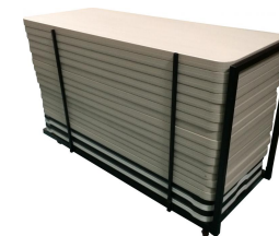
Table cart Réf CHTAB