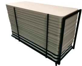
Chair cart Réf CHTAB