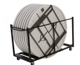
Table cart Réf 80193