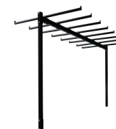
Upper part Réf CHCHARE